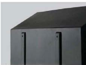
Rails on back allow for air circulation