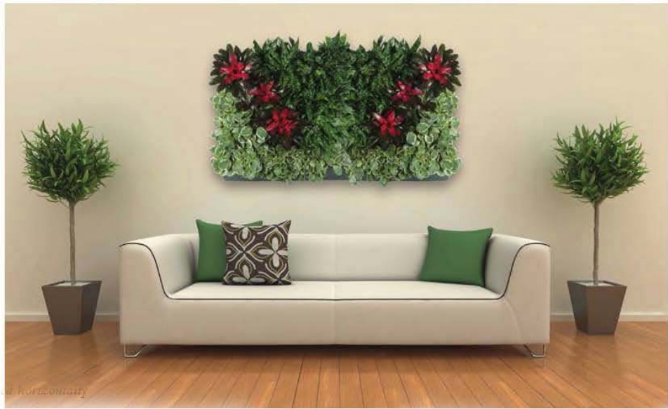
Two PP3232's arranged horizontally